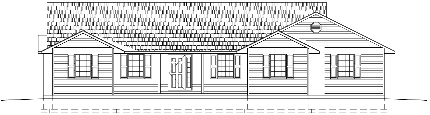
1 FRONT ELEVATION A-1